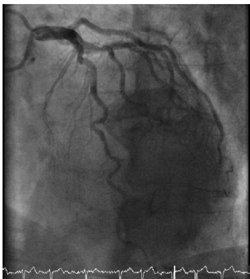
Figure 1. The left coronary artery.