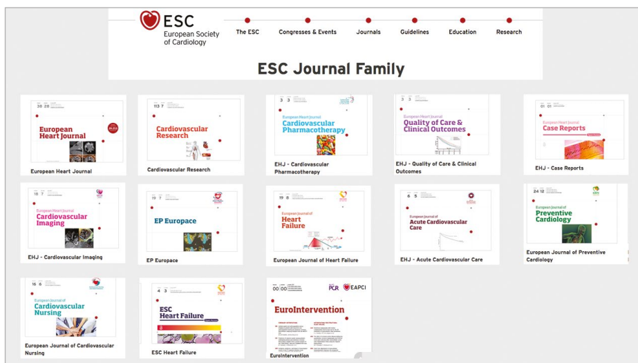
Figure 1. Overview of the cover pages within the ESC family.

A few years ago, the board consulted this readership by way of a survey, asking their opinion, specifically on the design, appearance and content of the cover page. Questions concerning the cover page included the arbitrary selection of a few generic topics found in the issue without acknowledging the authors, the need for the inclusion of the editors' names on the cover, the presence of a (small) selected medical illustration without a fully explanatory figure caption. The readership responded in a unanimous fashion, with the survey reinforcing the importance of publishing the full title of every paper as